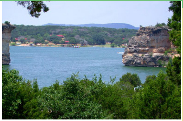
Possum Kingdom Lake

As we labor on through another legislative session, League members can look forward to great vacation opportunities after the session ends. A drawing will be held on June 10 for one of three fantastic prizes: two round-trip tickets on Southwest Airlines, a weekend night and breakfast at the Omni Hotel in Houston, or a two-night stay at a lake house on Possum Kingdom lake in North Texas. Only 300 chances are being offered. With a donation of $25, you get one chance; three chances are $50. Send your check to the State Office, and be sure to mark it TVFL. Checks should be made out to LWV-TEF. These donations also count toward the challenge grant, which is described in another article.